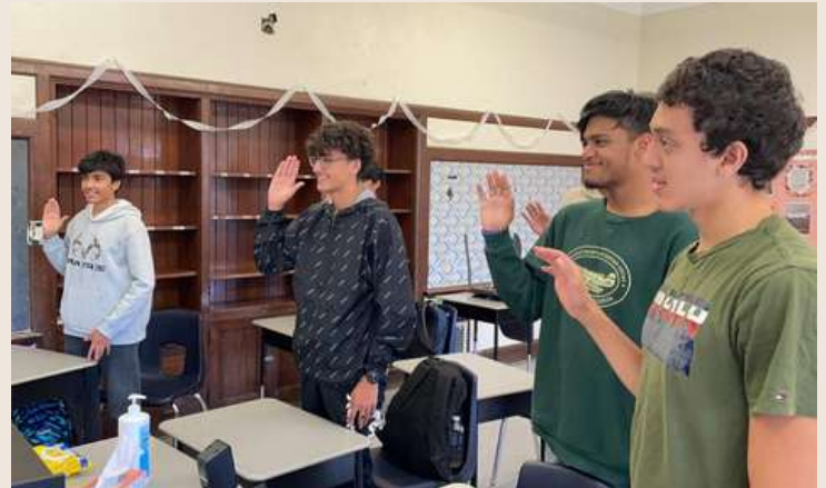
Student Council members taking an oath after elections.