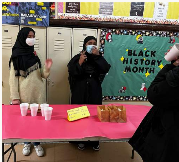
Hot chocolate fundraiser organized by the WIHS Event Club.